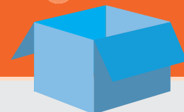
Potentially shippable product increment